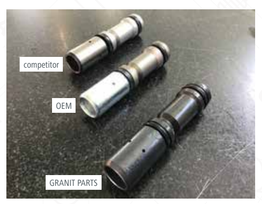
Figure 2: Brake piston.

Figure 1: The master brake cylinders from the three suppliers. Dismantled MBC. Visual assessment and dimensional comparison of the installed components.