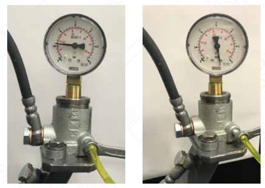
Figure 7 and 8: Possible pressure build-up before venting and after venting.