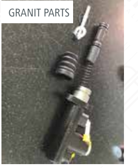
Figure 1: The master brake cylinders from the three suppliers. Dismantled MBC. Visual assessment and dimensional comparison of the installed components.