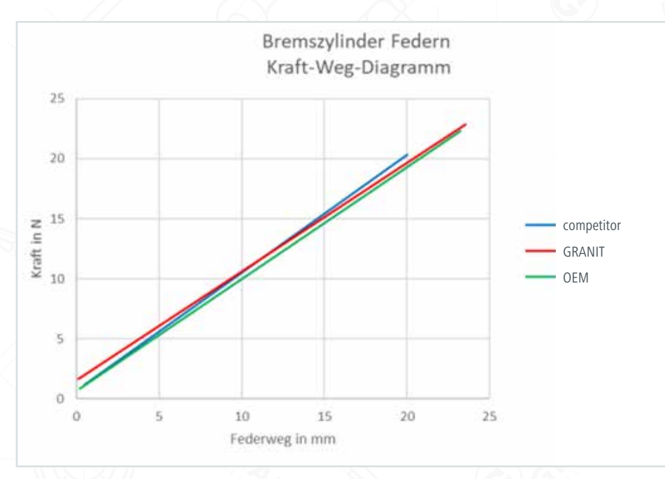
Figure 5: Determination of the spring force.

All three springs have approximately the same course and can therefore be described as equivalent.